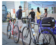
The Rapid and Founders Brewing Co. Pit Stop at Rapid Central Station